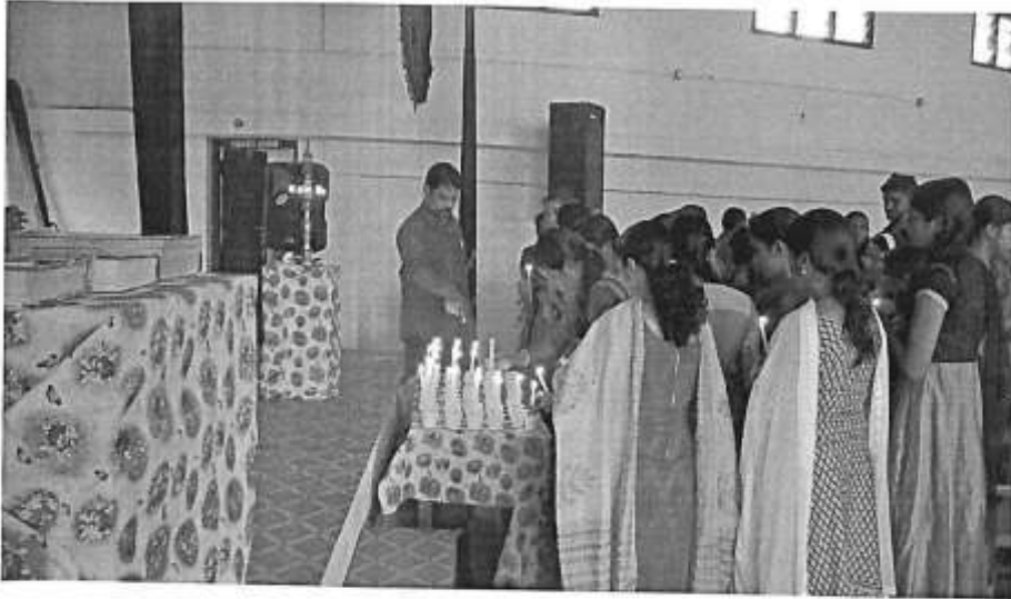
The programme came to an end by 12.30