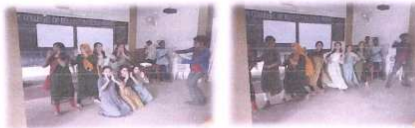
Name of the programme : Self Exposition – Valedictory Function Date: 14-10-2022