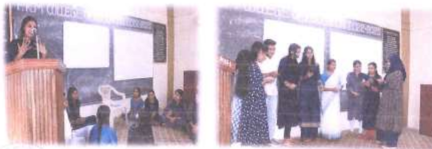
Name of the programme : Self Exposition – English, Date: 12-10-2022: