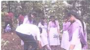
Students planting green crops

Appozhipparambil delivered benedictory speech, MASS