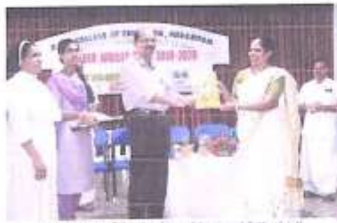
Releasing of Agricultural journal "Kathir"