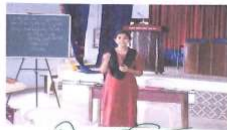
PRINCIPAL P.K.M. COLLEGE OF EDUCATION KAITHALTRAM, P. O., MADAMPAM SREEKANDAPURAM, KANNUR DT.,-670631