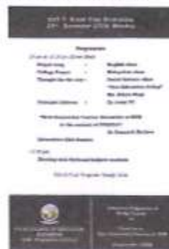
Brochure: Day 7 of Induction programme and bridge course