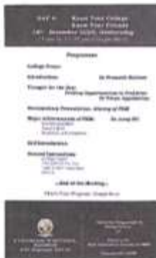
Brochure: Day 4 Induction Programme and Bridge Course on 16th December 2020

The fifth day of the programme conducted two main tests for student teachers through Google form. The tests were designed based on the focal theme of the induction programme and Bridge Course. To make the students more confident, it is important to make them aware about their ability. A teacher aptitude test was circulated among the students. The tests duration was one hour. This test help to analyse the teacher’s proficiency in numeracy, communication, literacy, adaptability and general skills. It will also help the students understand the area in which they need to work to improve their career. A teacher should be subject competent and well equipped. A subject competence test of one-hour duration was also conducted for the students in optional wise.