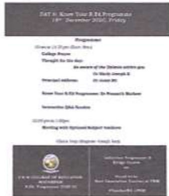
Brochure: day 6 of Induction programme and bridge course