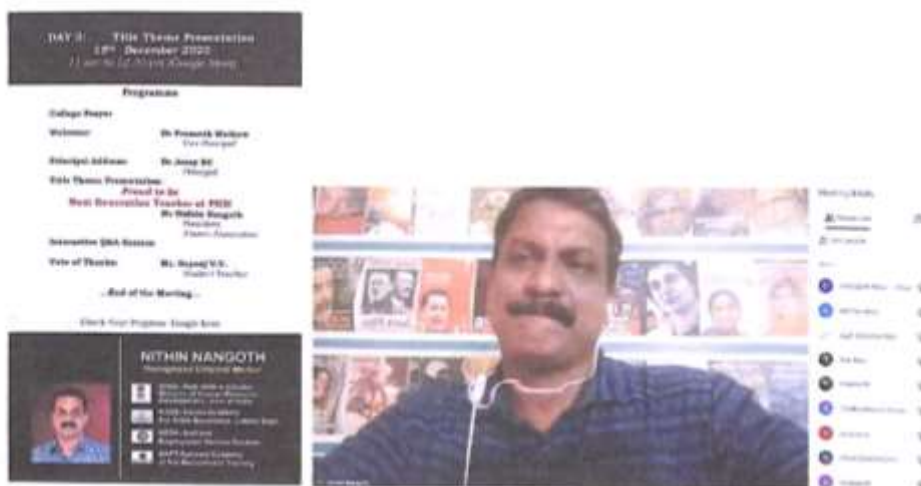
Brochure: Day 3 Induction programme and Bridge Course