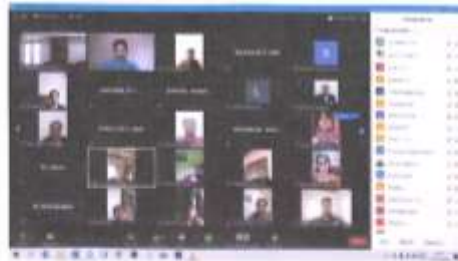
Screenshot of zoom meeting on 10 th December 2020.