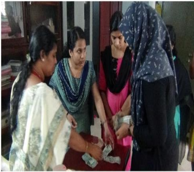
collecting the fund by staff coordinators and students