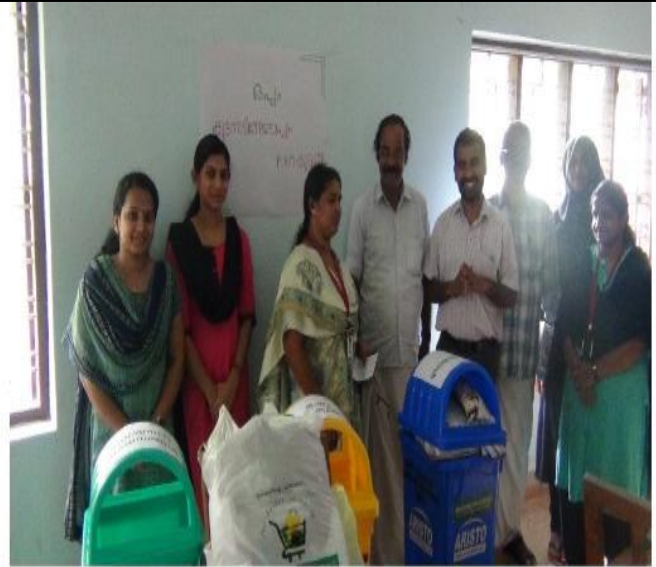
handing over the collected fund and cloths.